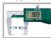
depth stop 6143 (optional)